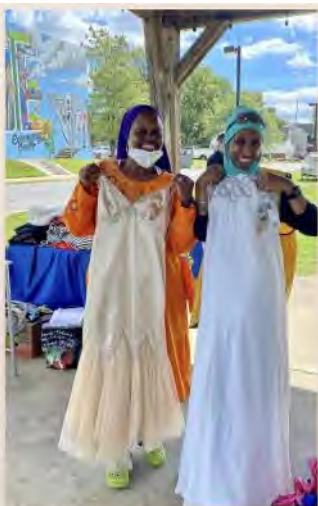
COLLECT GAWNS FOR POLICY AND PRINCESS BALL