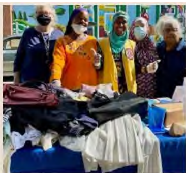
ENVIRONMENTAL PROJECT: COLLECT AND DISTRIBUTE CLOTHES TO AFRICA, AT FRESH FOOD GIVEAWAYS AND SHELTERS.