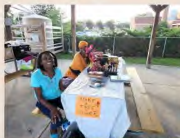
AT OUR SERVICE PARTY WE SORTED 160 GLASSES & 12 SUNGLASSES SORTED 5 BAGS OF CLOTHES TO BE DONATED TO SHELTERS PLANTED FLOWERS TO GIVE AWAY DELIVERED 3 BOXES OF NONPERISHABLES TO FAMILIES THAT NEEDED THEM MADE 50 HYGIENE BAGS.