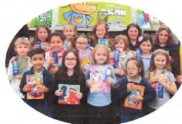
I LOVE TO READ CONTEST