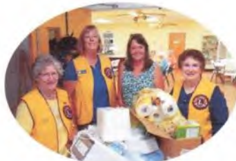
SENIOR CITIZEN AID